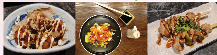
Takoyaki 章魚小丸子 | Chirashi Salad 魚生片沙拉 | Yakitori 雞肉串