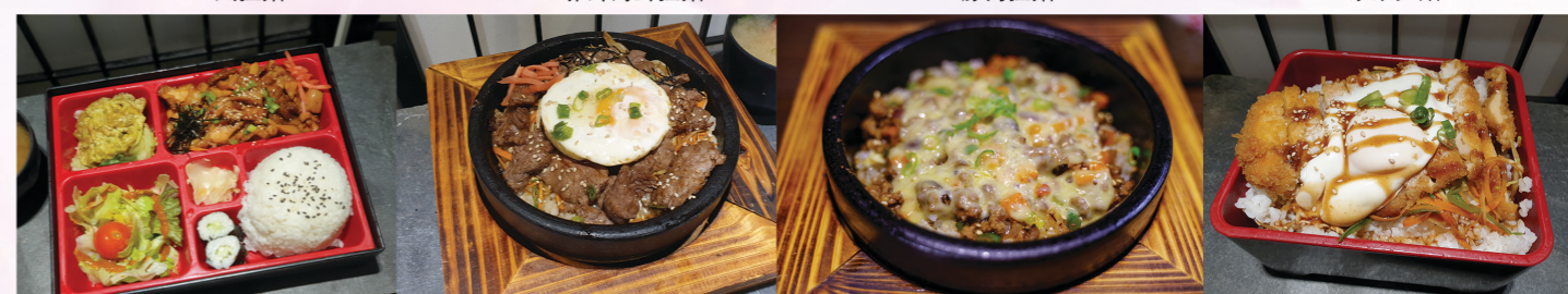
Chicken Teriyaki Bento 照燒雞肉便當 | Sirlon Steak & Yuzei Egg on Fried Rice 玉子牛扒飯 | Beef Fried Rice with Japanese Cheese 京都芝士牛肉飯 | Oyako Don 親子飯

ALLERGENS: If you have a food allergy or special dietary needs, please notify a member of our hospitality team. We cannot guarantee that any of our beverages or foods are allergen or contamination free. (v)Vegetarian, (C)Celery, (G)Gluten, (CR)Crustaceans, (E)Eggs, (F)Fish, (L)Lupin, (MK)Milk, (MO)Molluscs, (M)Mustard, (S)Sesame, (SO)Soya