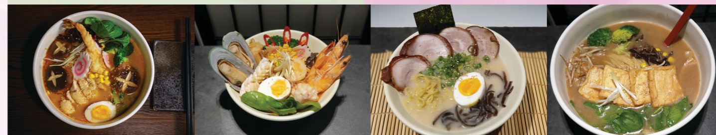
Ipfu Ramen 一風拉麵 | Mixed Seafood Ramen 雜錦海鮮拉麵 | Pork Chashu Ramen 豚肉拉麵 | Yasai Miso Ramen (v) 素菜拉麵