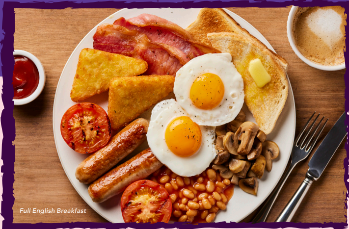
Full English Breakfast

PICK YOUR DISH THEN PICK YOUR DRINKS. FROM £28 PER PERSON