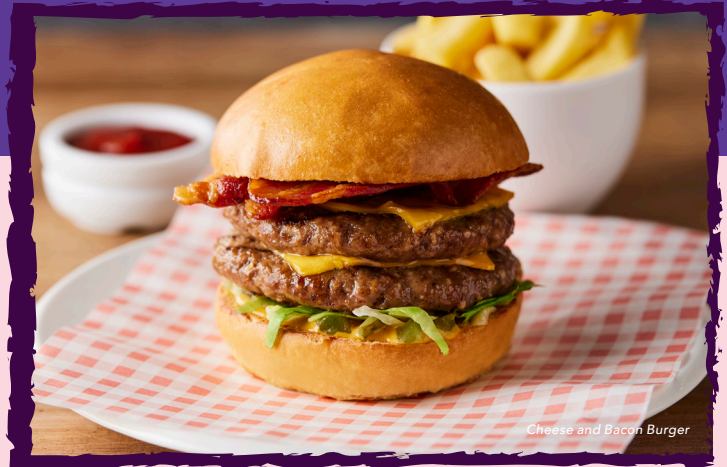
Cheese and Bacon Burger